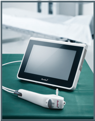
Ambu® aScope™ 3 Slim and Ambu® aView™