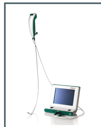
Ambu® aScope™ 2 and Ambu® aScope™ Monitor