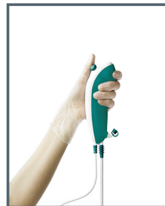
Hand position and bending section