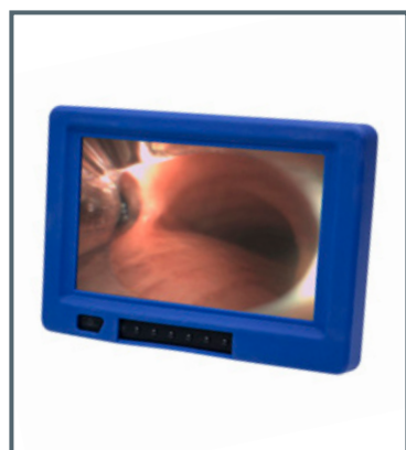
VivaSight Max 7" Monitor Compatible with VivaSight-DL and VivaSight-SL