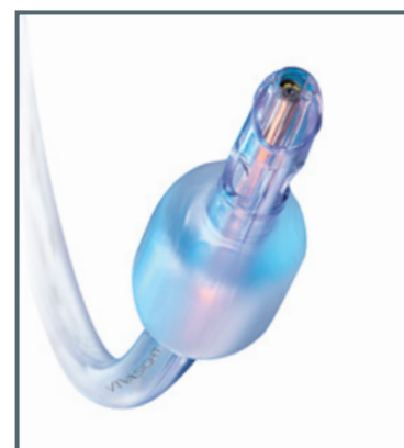
VivaSight-SL Single lumen endotracheal tube with integrated camera at tip of tube.

Manufactured by ETView Ltd. Catom 2 Street Misgav Business Park M.P. Misgav 2017900 Israel